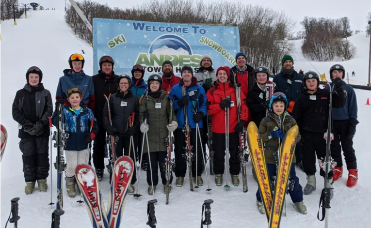
All-Church & Youth Skiing at Andes Tower Hills on Saturday, January 25

Wednesdays 6:30pm-7:30pm Feb 5: Learning Event #13 Feb 12: Learning Event #14 Feb 19: Mentor Event Feb 26: Ash Wednesday: NO CONFIRMATION No Confirmation during Lent. We will start up again on April 15.